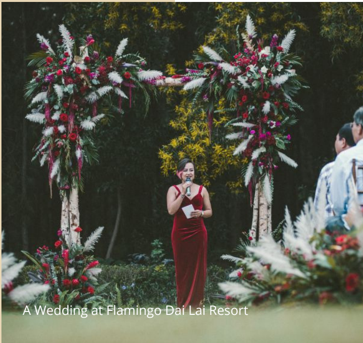
A Wedding at Flamingo Dai Lai Resort