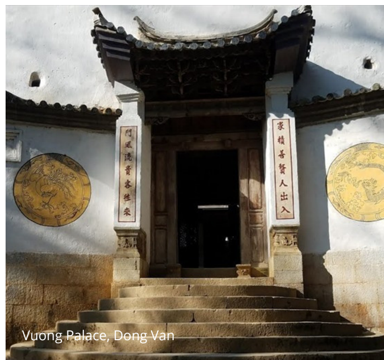
Vuong Palace, Dong Van