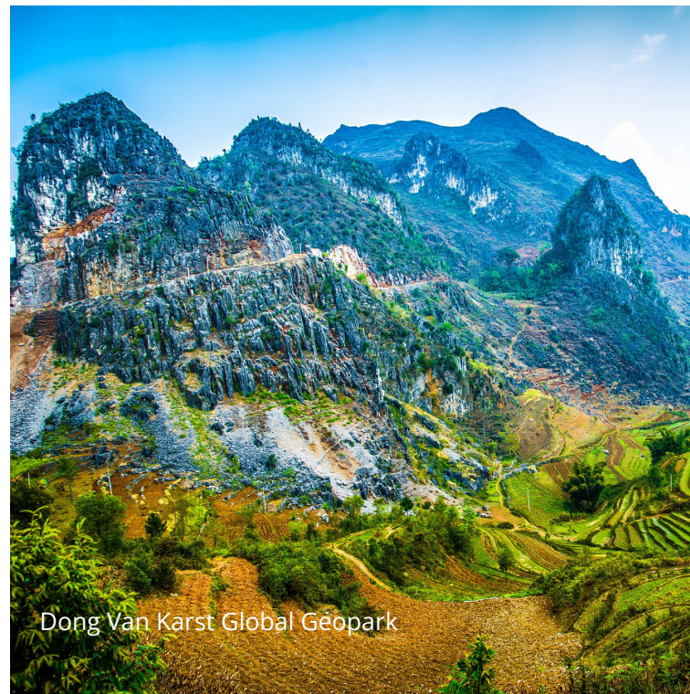
Dong Van Karst Global Geopark