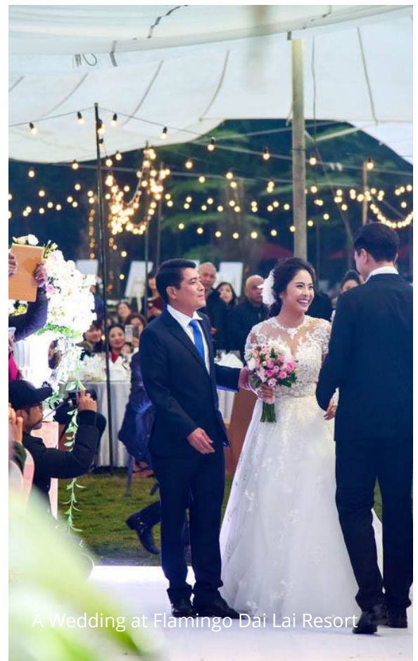
A Wedding at Flamingo Dai Lai Resort

Other alternatives: In addition to the above Lai Resort is also home to many other outdoor ceremony venues and indoor dining halls. Please consult our Flamingo Wedding Specialists for more - we would be delighted to help you find and choose the right setting for your wedding.