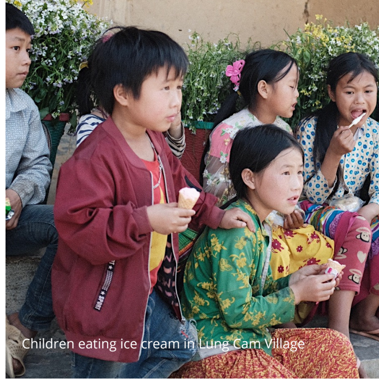
Children eating ice cream in Lung Cam Village

Note: There aren't many travel options to choose from, and while most of them are easy enough, there is one thing to take care of if you want to fully explore the beauty of Ha Giang – getting a local travel permit to visit preserved remote villages, which are usually the farthest and the most beautiful destinations such as Meo Vac, Dong Van, and Lung Cu etc..